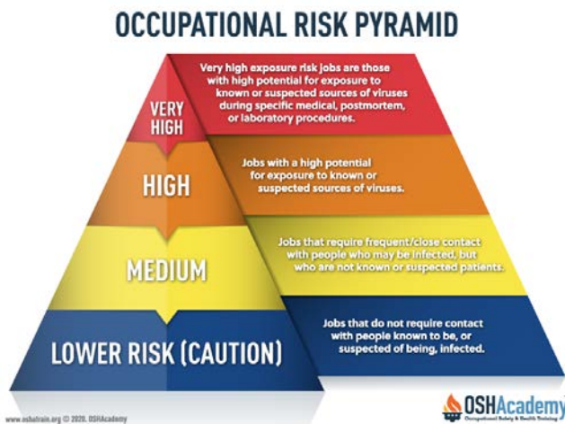
Figure 1: OSHA risk exposure pyramid (4)