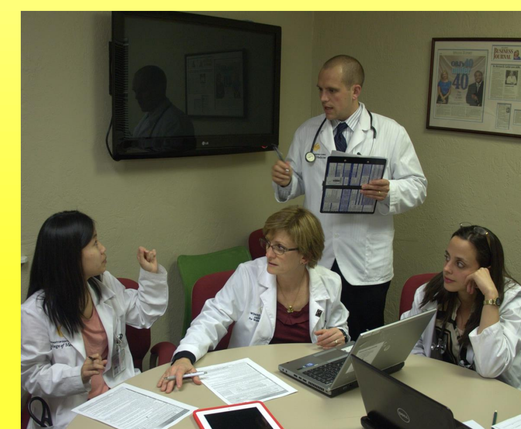
Figure 1 (right): Students are trained and participate in every step of the process.