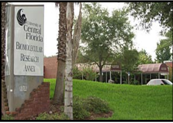
Biomedical Research Annex, Research Park