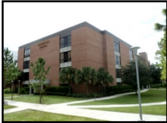
Biomedical Sciences Building, Main Campus

Faculty and staff in the School are located in four areas: The Biomedical Science and Health & Public Affairs II Building on Main Campus; the Biomedical Research Annex in Research Park; and the Burnett Biomedical Sciences facility, adjacent to the College of Medicine at the Lake Nona Medical City Campus.