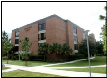
Biomedical Sciences Building, Main Campus

Faculty and staff in the School are located in five areas: The Biomedical Science and Health & Public Affairs II Building on Main Campus, the Biomedical Research Annex in Research Park, the Burnett Biomedical Sciences facility, adjacent to the College of Medicine, and the Lake Nona Cancer Center at the Lake Nona Medical City Campus.