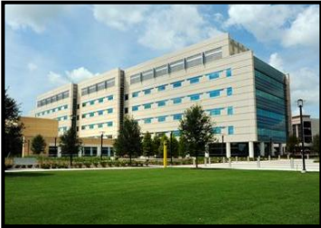
Burnett Biomedical Sciences Building, Health Sciences Campus