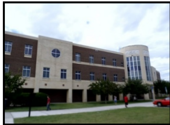
Health & Public Affairs II Building, Main Campus