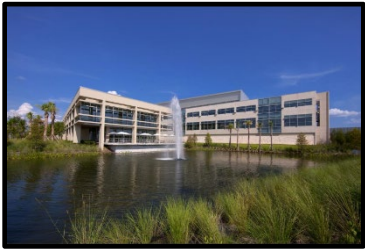
UCF Lake Nona Cancer Center, Health Sciences Campus