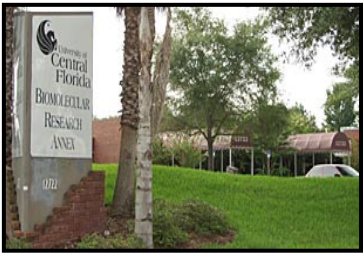
Biomedical Research Annex, Research Park